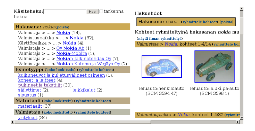
Fig. 2. The search interface of MUSEUMFINLAND.

of MUSEUMFINLAND, the user, not really looking for anything particular, may decide that he'll start with looking at items used in Europe. In the results, he then sees several chairs he likes, and decides to constrain his search to furnishing items used in Europe, and so on.