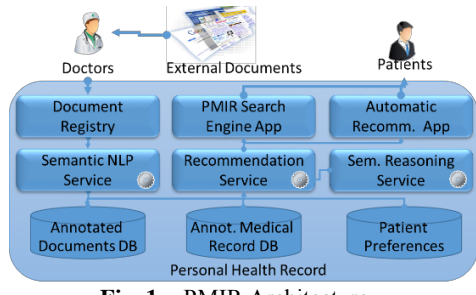
Fig. 1. - PMIR Architecture

The architecture of the system is shown in Fig. 1 and consists of three layers: The database layer including three different databases, the service layer including three services and the front-end layer including three individual apps.