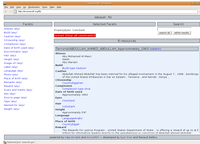
Fig. 2. Faceted browsing prototype

We have used ActiveRDF in the development of our prototype faceted browser, available on http://browserdf.org and shown in Fig. 2. We have improved faceted browsing, a navigation technique for structured data, with automatic facet construction to enable browsing of semi-structured data [5].