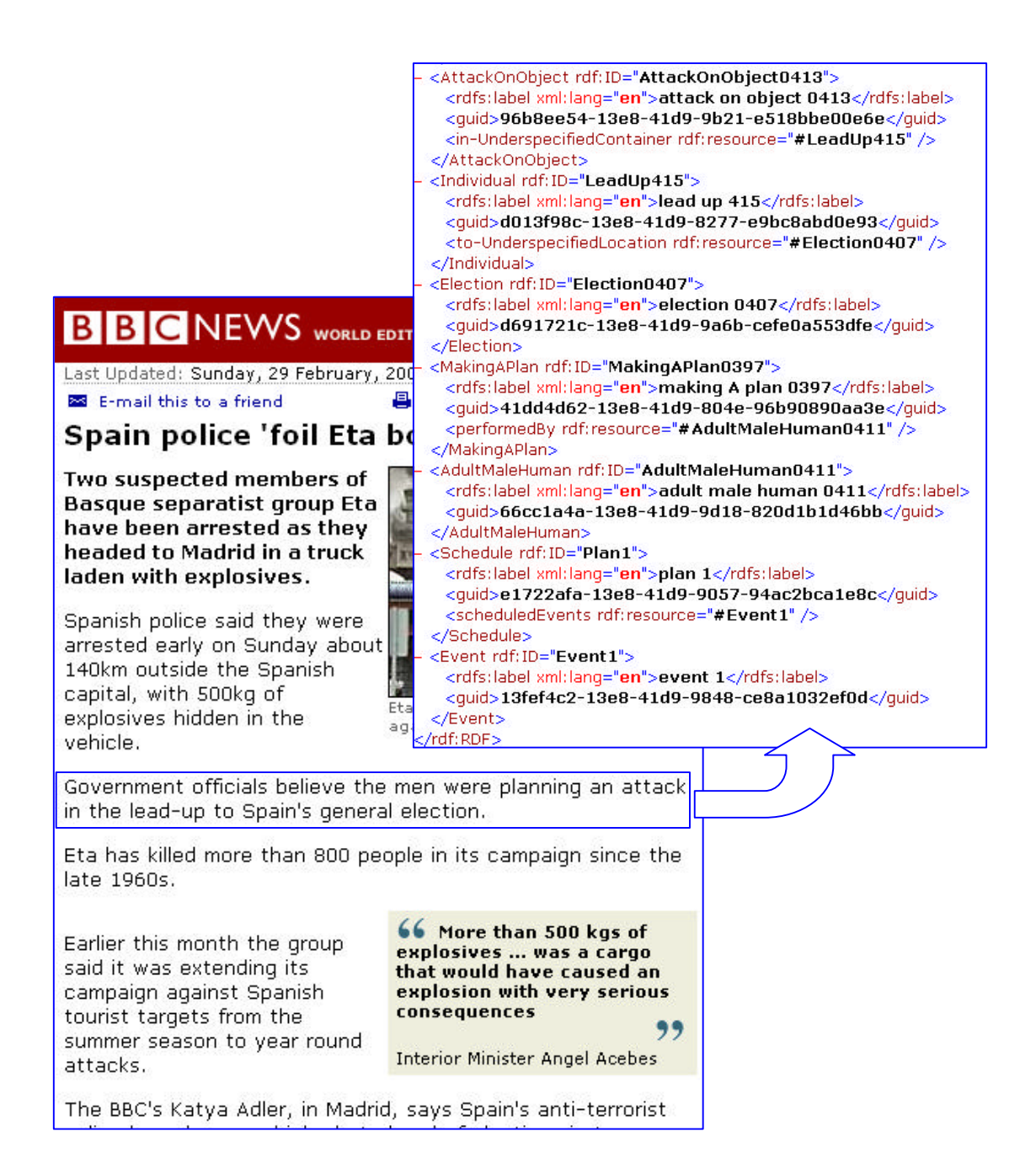
Figure 1: The Cyc Document Annotator assists organizations and individuals interested in adapting their document production processes to the Semantic Web. By providing an approximate OWL annotation of an existing document, the system simplifies the initial learning curve, allowing editing to improve the annotation to replace the complex task of manually annotating a document from scratch. Interoperability is supported by annotation using the more than 60,000 freely usable terms in the OpenCyc scaffolding ontology.

The OWL export component of the system is described in more detail later, but the core of the annotation system depends on Cyc's imperfect but growing ability to interpret free text into a detailed logical representation in CycL. This is provided by combined application of Cyc's natural language processing subsystem, disambiguation dialogue, and the Factivore, a highly usable knowledge-driven knowledge acquisition interface.