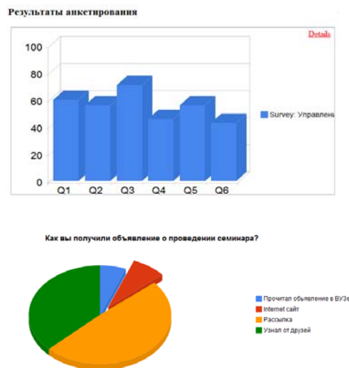
Fig.2. Graphical presentation of the survey results.