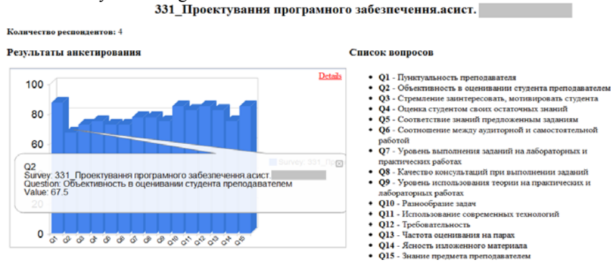
Fig.1. Example of voting results presented by chart.