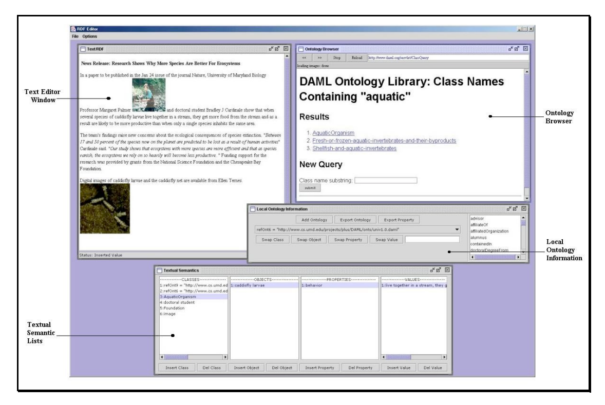
Figure 1: The RDF Editor Interface