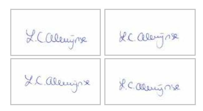
Fig. 1 Offline specimen signatures collected under controlled conditions.

For offline data collection all that is needed is a pen, a piece of paper and a scanner. To aid the writer, a guiding line or box can be used. The easiest and practical solution is to use an underlying sheet of paper with the lineation or boxes printed with a black, bold line. No lineation or bounding boxes must strike trough the writings. In this way, the data is kept 'clean' and less effort for data preparation is needed.