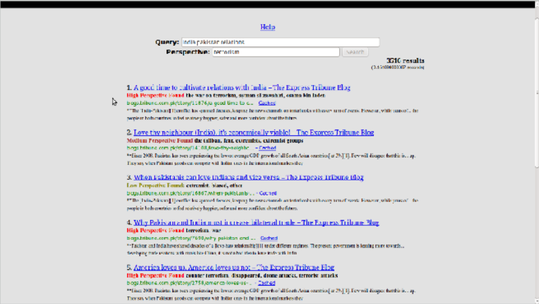
Figure 2: Search Results within Perspective-Aware Search