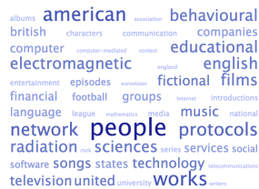
Figure 2.1 Top Topics across Facebook groups

and super users, which are the most active and engaged roles. The application allows monitoring the role composition over time for all Facebook groups as well as monitoring the behaviour of individual users. For a particular user the application displays her role path (the different roles that the user adopts over time) in all Facebook groups where the user has participated. Studying the user's behavioural paths can help us to detect particular patterns that students follow before dropping or losing interest about course. Note that each of the studied Facebook groups is linked to a particular OU course. To obtain information about the course, therefore complementing the results of the analyses, we make use of the OU's linked data portal ( data.open.ac.uk ). Using different SPARQL queries we can obtain information about OU courses, their title, description, available locations, required level and categorisation, among others.