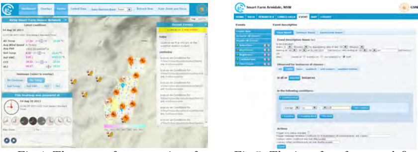
Fig 4. The smart farm map interface

GSN is particularly useful in micro-management of live sensor data. However, GSN in its original form has a few limitations: it requires upgrades of dependent libraries; it lacks some important concepts (e.g. it is not possible to specify the units of measurements); it supports limited situation monitoring queries; and it does not provide data in a format expected by the semantic web community. We have modified GSN to overcome these limitations. In addition, we have extended