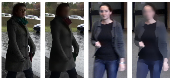
(a) Original. (b) Modified. (c) Original. (d) Modified.

Figure 2 presents two pairs of frames (original and modified) which show the results of the applied cartooning effect. The re-colouring of personal items is nicely visible at the scarf and the bag in Figure 2b.