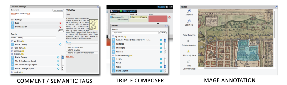
Fig. 1: Creating annotations with Pundit