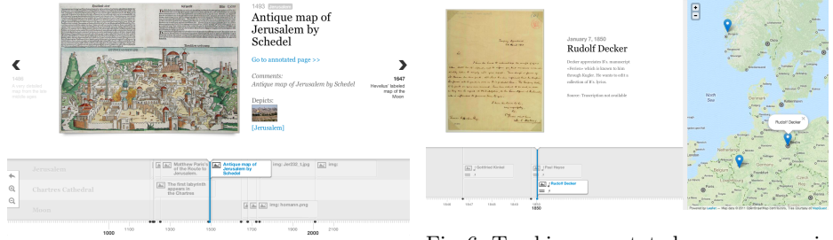
Fig. 5: Timeline visualization