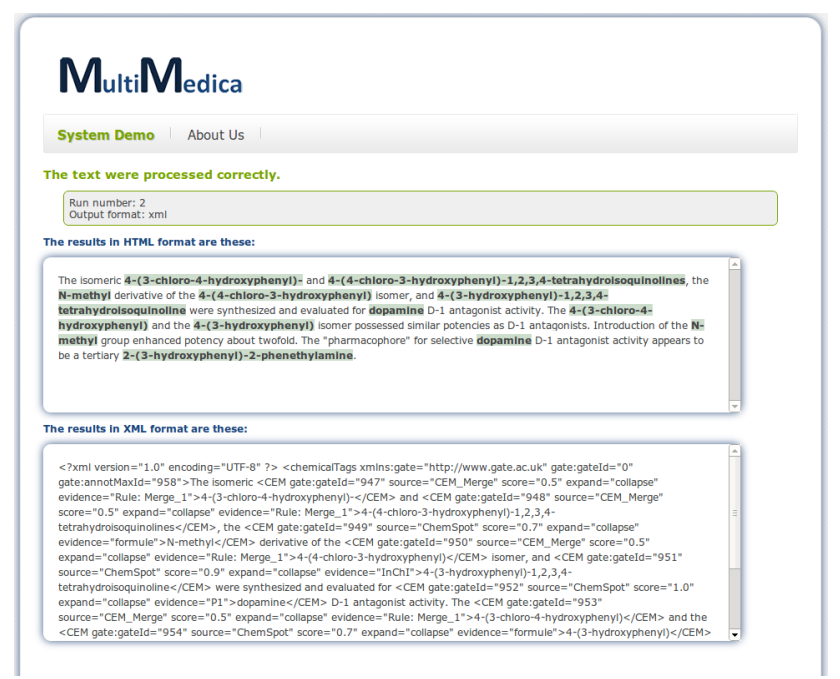
Fig. 2. A web tool for identifying chemical compounds and drugs.

Figure 2 shows a screenshot of the web tool. The tool allows users to write a text to be processed by the system. As result of the processing, chemical compounds and drugs appear highlighted in text. Also, the identified chemical compounds are linked to the ChEBI database.