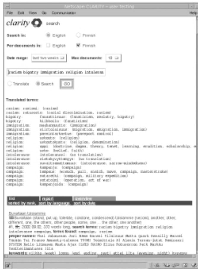
Figure 1. The layout that forces the user to check the translation (Trans).

Our research goal was to test if the query translation step had to be considered as a separate task with respect to searching or if it was a better design solution to hide it. If our iCLEF subjects performed better on the interface that does not display query translation (referred to as NoTrans) than on the interface that forces a query translation check before the search (referred to as Trans), then hiding the translation would be considered the best design choice in general.