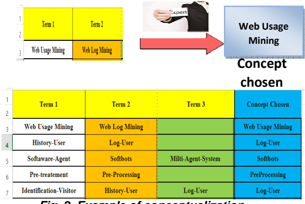
Fig. 2. Example of conceptualization

For example (figure 2), from the terms (History-User, Log-User) were selected, by means of a domain expert, the concept candidate "Log-User". From the terms (Web-Usage-Mining, Web-Log-Mining) were selected, by means of a domain expert, the concept candidate "Web-Usage-Minig".