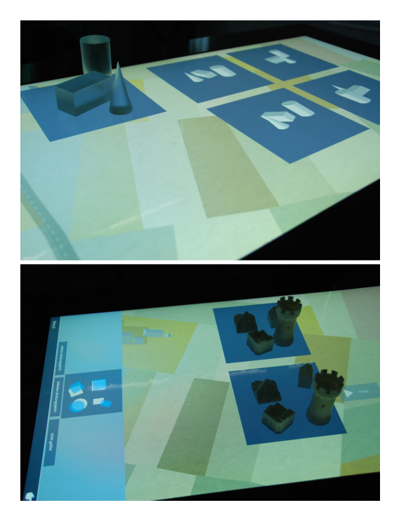
Figure 6: The modules Spatial Cognition (simple objects) and Spatial Construction (complex objects).

can decide how many perspectives should be generated and which one should be asked from the user. The module can be used with two different sets of objects: simple (e.g., a pyramid, made of acrylic glass) and complex (e.g., a house, 3D-printed) ones. All objects are tagged to be recognized by the system. We consider this (and the following) module a successful fusion of physical elements and a digital world.