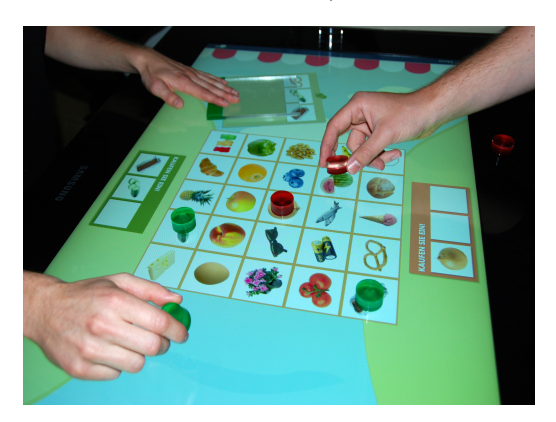
Figure 4: Interaction with the Shopping module in the multi-user setting.