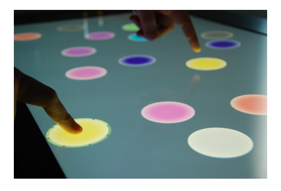
Figure 1: Interaction via delayed touch.