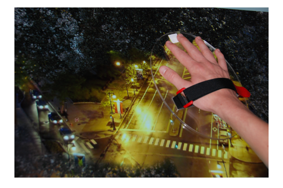
Figure 5: The module "Window Washing" with physical cleaning element fixed to the user's hand.

a digital fly moving around the table) ones. The user receives acoustic and animated feedback if a plate with food is missed. After all food has been collected, the user receives a picture of the complete menu and acoustic feedback.