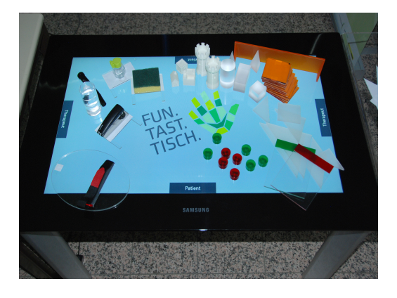
Figure 3: The different kinds of objects that are part of the fun.tast.tisch. user interface.

The material of all objects was chosen carefully based on different considerations. Some physical interaction elements needed to be semi-transparent, others needed to be fully transparent (e.g., in case the system should not recognize them). The modules that allow for a multi-patient setting needed objects of different patients to be distinguishable, which was solved by different colors. Further, all objects needed to be easily clean- and disinfectable, well graspable (these are domain-specific requirements) and needed to be solid enough not to break when dropped. After tests with different kinds of materials, we arrived at i) objects made of acrylic glass, individually designed for fun.tast.tisch., and ii) 3D printed ones. Figure 3 shows the different kinds of physical objects currently used within fun.tast.tisch.