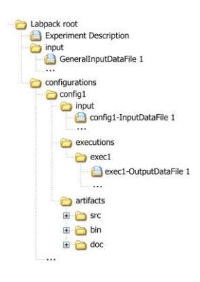
Fig.3. SEA folder structure layout

MOEDL (Metaheuristic Optimization Experiments Description Languages) is a domain-specific language for the description of metaheuristic optimization experiments (such as techniques comparison experiments, or parameter tuning experiments). Its goal is reduce the time and expertise required for describing those experiments. MOEDL documents are divided into three main sections: problems, techniques and configuration. The former includes details about the problem such as its type and problem instances to be solved. The second includes information about the metaheuristic techniques used to solve the problem, the termination criterion and random number generator used. The later includes information about the configuration of the experimental execution. A detailed description of the syntax of MOEDL and with several examples are provided in [2].