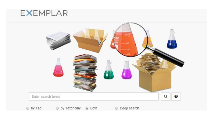
Fig.2. Experimental information search in EXEMPLAR

Currently workspaces are either public (meaning availability to anyone in readonly mode) or private, but authors plan to implement workspace sharing among users in read-write mode as future work. Each workspace contains an unlimited number of lab-packs. Each lab-pack contains the information of a single experiment, structured as an unlimited number of files and nested folders. The workspaces and labpacks management interface of EXEMPLAR is shown in figure 1 (left side). Search and Indexation . EXEMPLAR supports two different search mechanisms. On the one hand, users can search labpacks based on their tags or classification according to standard taxonomies (for software engineering experiments we support the SWEBOK taxonomy of areas [1]). On the other hand, users can perform full text searches on the indexed contents of the labpacks. Figure 2 shows the search page of EXEMPLAR.