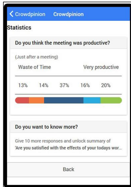
Figure 3. A summary of responses, described in Section 5.

The first element is based on assumption that the participants are curious about responses of other people and the overall results of the studies. The fact that they agreed to take part in a study suggests that they are interested in the case, so we believe our assumption is right. When a participant subscribes to a study, they have access to a summary of responses to one of the study's questions. There is also an information that in order to unlock the summary of another question, the user has to give 10 responses themselves. With each