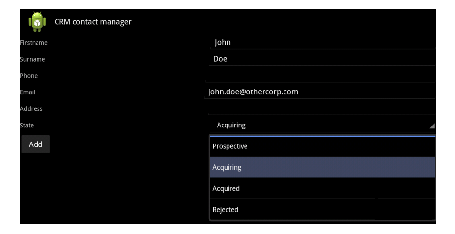
Fig. 2. Generated Android view