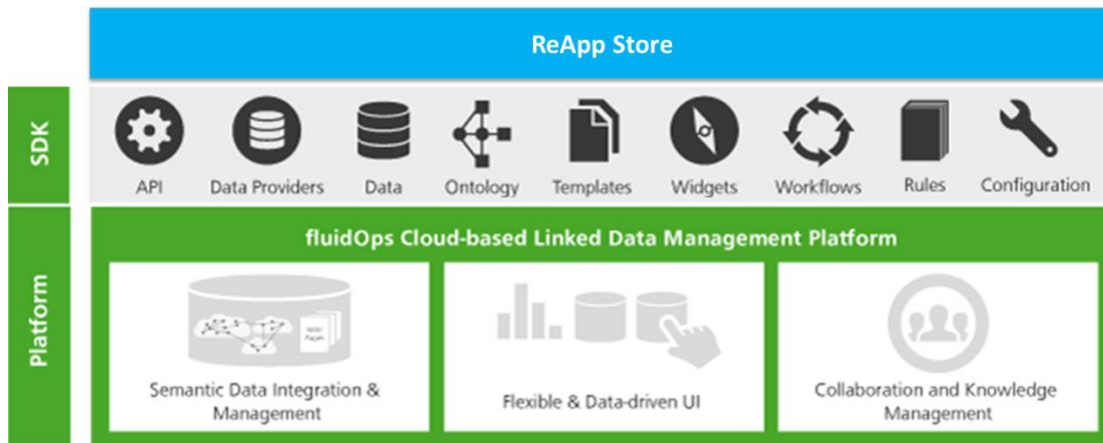
Fig. 1. ReApp Store Architecture

Moreover, the hardware and software taxonomies contain axioms that allow for the computation of capabilities that hardware components and apps exhibit. This enables a reasoner to infer the capabilities needed, e.g. for building a Pick&Place application, or to retrieve a list of components that satisfy a specific capability requirement.