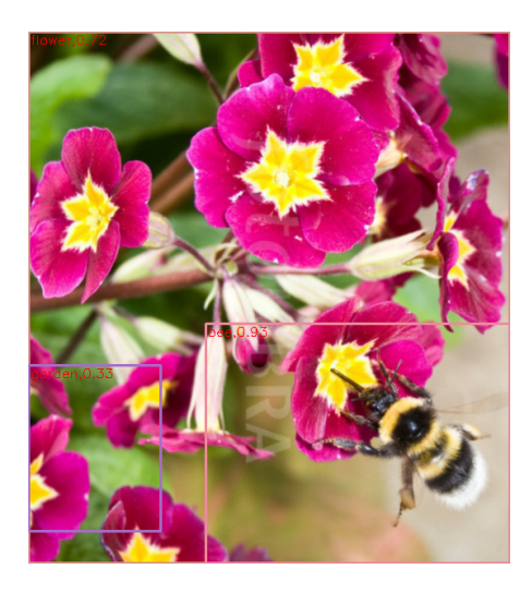
Fig. 2. On the left, we show the concepts regions proposed by our pipeline. The purple region corresponding to "flower" covers the whole area. The yellow region corresponding to "bee" is in the bottom right corner and there is also a green region corresponding to "garden" on the bottom left corner. We also display these mapped regions on the original image.