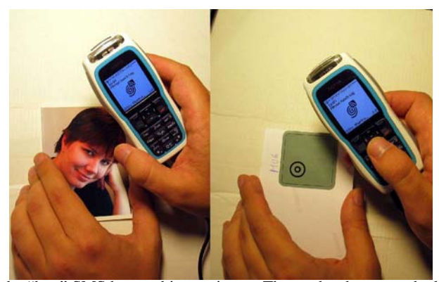
Fig 4. Sending the "hug" SMS by touching a picture. The tag has been attached to the backside of the picture. The user keeps this picture in his wallet, and is able to send the "hug" without taking the picture out of the wallet.