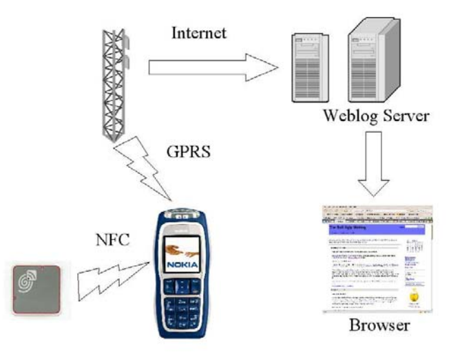
Fig 1. System overview. All applications are built around the same base system.