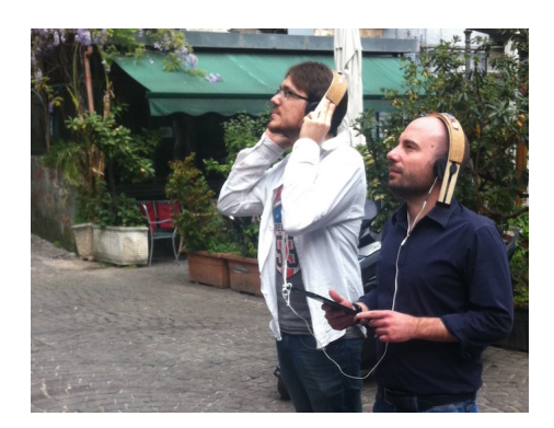
Fig. 2. A test of Caruso