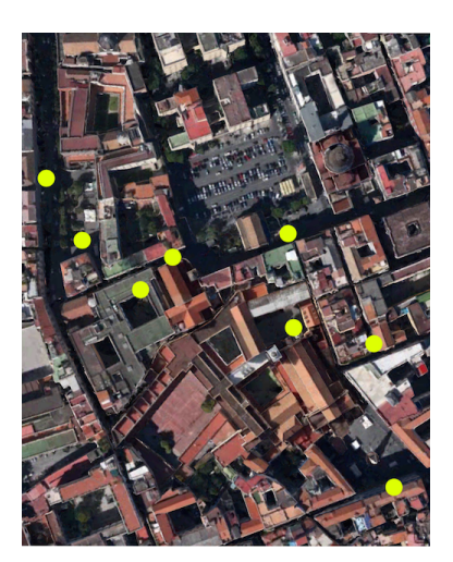
Fig. 3. The POI of Caruso

An interactive audio-guide: As presented in section 3.3, Caruso has been used as a audio-guide in the historical center of Naples in the experimental process of the Or.C.He.S.T.R.A. project. Figure 3 shows the proposed POIs.