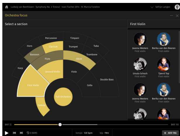
Figure 2 Visualization of instruments playing

During the concert users can follow a feed of comments on their tablets. The comments are authored by an editor or by other users in the hall. Whereas traditional program notes offer background information without an audible link to the music, the timed editorial comments help users connect relevant information on the concert timeline to audible events. For example, Richard Strauss’s ‘Eine Alpensinfonie’ describes the wonders of hiking through the Alps. During the performance, users could read the following explanation at the time it mattered: “ And then comes the calm before the storm. (...) The wind starts to pick up. We hear descending scalar figures from the introduction. The finale of the symphony begins. ”