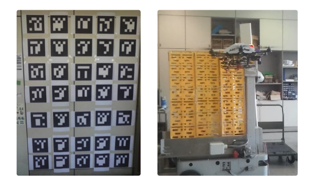
Fig. 1. The markers used for localization and the esarotor Asctec Firefly hovering

the Otsu's algorithm [3]. When a marker is recognized, the relative distance and orientation of the camera with respect of the marker is given.