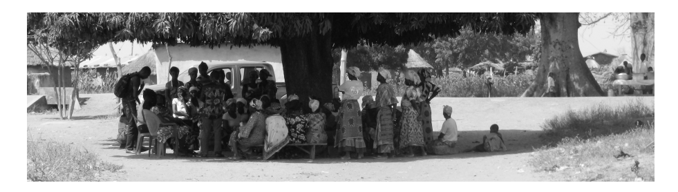
Fig. 1. A typical requirements analysis workshop with farmers in Guabuliga village, northern Ghana, December 2014

Case: Context analysis in Ranawa, Burkina Faso A context analysis was done e.g. in 2009 in Ranawa, a rural community of 2300 inhabitants, in the Central Plateau of Burkina Faso. This rural village is representative for a low-resource, low-tech community. People live from subsistence farming and produce millet, sorghum, sesame and have some livestock.