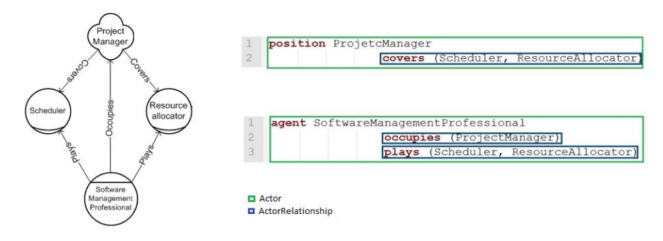
Fig. 2. Definition of Actor and their structural relationships (textual and graphic)

The semantic understanding of i^* Framework enables researchers to best understand the relationship among i^* elements. This knowledge helped us depict a metamodel where the actor is framed by three elements: The (i) ActorAssociationLink defines the relationship among actors, indicating the organizational structure. (ii) The DependencyRelationship represents dependency relations of the actor through an intentional element. Semantically, there is the perspective of the depender and another of the dependee on the intentional element. (iii) The IntencionalElement describes an internal relationship of the actors with the intentional elements; an actor consists of intentional elements. The proposed textual model is shown through transformations from the graphical model [7] to textual model. Fig. 2, shows a graphic model being represented textually. It was used two actors ( Project Manager and Software Management Professional) to illustrate the transformation, in which the actor may contain or not an ActorAssociationLink references other actors.