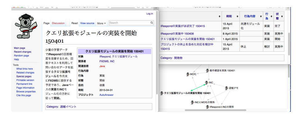
Fig. 3. User interface of the system