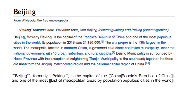
Fig. 2. Part of the Wiki page of Beijing and its source text

Annotating mentions and entities in a corpus is a time-consuming task. Fortunately, if we use Wikipedia as a knowledge base, it contains all the annotations we need. Figure 2 shows part of the page of Beijing in Wikipedia and its source text in editing model. In Wikipedia, a internal hyperlink is annotated by [[entity | mention]]; it also could be [[entity]] when the entity is mentioned by the exact name of it. Processing these inner links, we can generate the corpus containing words, mentions and entities together. So in this paper, Wikipedia is used as the target knowledge base that entities link to, and its articles are processed to train the skip-gram model.