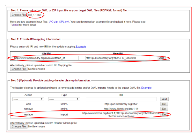
Fig. 1. Ontobull web interface. The circled settings are used in the use case demonstration described next.

The Ontobull web program provides a user-friendly interface for input of an ontology file and conversion settings. The Ontobull Java program, developed using the Spring Model-view-controller (MVC) framework and Thymeleaf template engine, processes the user's requests and generates an Ontobull OWL output file. The BFOConvert program is a subprogram of Ontobull specifically targeting conversions involving a move from use of BFO 1.1 to BFO 2.0.