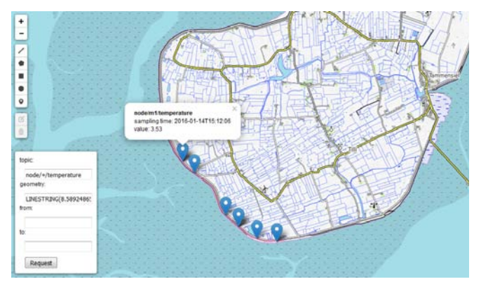
Fig. 3: Web map application to request GeoMQTT events using the REST bridge

The bridge and application do not represent a substitution for SWE data storage services such as the Sensor Observation Service (SOS). We use it mainly for fast debugging of our sensor networks or to send configuration messages to the sensor nodes.