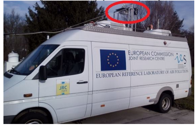
Fig. 2. AirSensEUR deployed at JRC, Ispra, Italy.

From the perspective of citizen science the benefits from our developments are twofold. On the one hand it provides a solution for the combined handling of citizens contributions and public sector information so that administrations at different geographic scales can start investigating potential implications and enhancements of traditional environmental monitoring. AirSensEUR thus feeds debates and reflections in the public sector. On the other hand, citizen scientists and DIY scientists might assume that the data that they collect can contest officially published information. It might lead to a loss of trust in projects about public participation in scientific research if they found out that this assumption does not hold. The platform provides one option to resolve these issues. It has the ambition to provide a balance between accurate measurements and the costs of the solution that would fit the purpose of European-level quality standards.