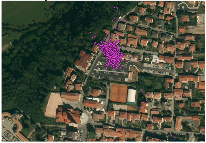
Fig. 3. Observation data with 'fake' movement

2) Semantic issues: We used 52 \circ North SOS, REST API and restful-timeseries-proxy. The former helped us to meet INSPIRE obligations, while the rest we used to process data in a faster and more efficient way (when compared to using XML). That is why we see this bundle of products fit for purpose and well positioned in order to enable access to observation data in a cross-domain setting. The 52 \circ North REST API however introduces terminology that is different from SWE (station, timeseries, etc.). We would welcome alignment of the API with OGC terminology, which would avoid possible confusion, and the unnecessary need of one to map between the terminology defined in SWE and the nonstandard REST API. Furthermore, this would very likely help alignment of the latter to OGCs standards as described in Section 3.1.