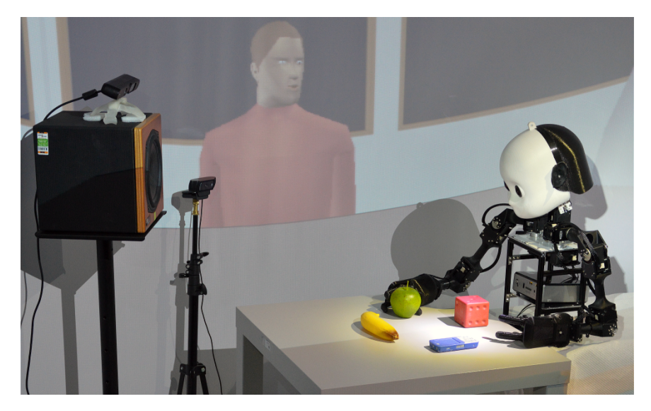
Figure 2: The learner explores interaction with objects, while the knowledgeable teacher describes the respective interaction in natural language.