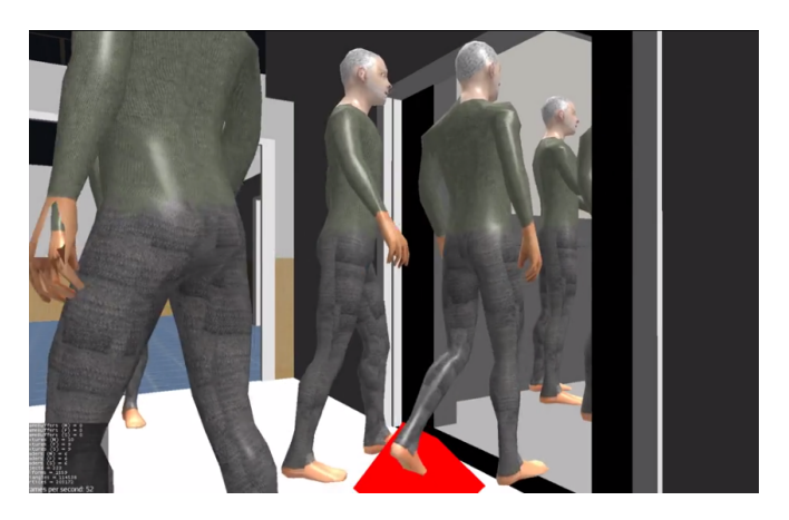
Figure 3. Elevator carrying people from one floor to the other

The problem becomes more complex when the activities of the daily living is added to the considerations. The protocol of lectures in a classroom is simple: students come to the classroom; they sit down; a teacher comes and starts the lecture; more students may come during the lecture; the lecture finishes and then all, or a few, students leave the room. The uncertainty in the process, such as teachers finishing sooner or later, makes the evacuation of students from classrooms more smoother than it should be if all teachers coordinated