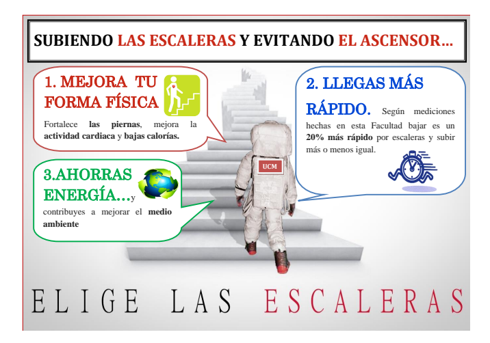
Figure 1. Banner for motivating users to use the staircase. It written in spanish. The main title says stair climbing and avoiding elevators at the top. The alleged reason are 1. improving your health , 2. You will get faster to your destination , and 3. you will save energy

A plan for measuring the effects of these stimulus was made. The plan consisted on a five week schedule. The first week (week A) there was no stimulus and it was used to collect a base line of staircase/elevator traffic stats; during the second week (week B) the banner stimulus was introduced; along the third week (week C1) the videos were added; and in the fourth week (week C2), the humanto-human interaction. Then, there were some days of no stimulus to let users decide whether they want to keep the new behavior or get back to the old one. Therefore, the fifth week (week D) is dedicated to measure the resilience of the stimulus.