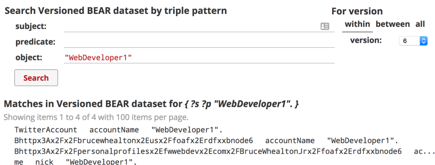
Fig. 1: VM query HTML form and results.