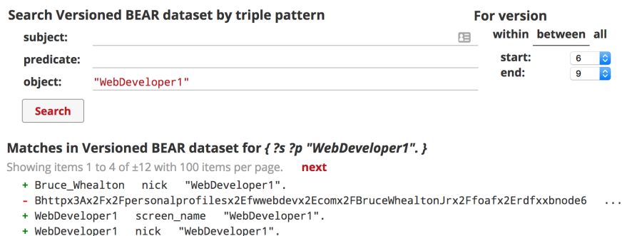
Fig. 2: DM query HTML form and results.