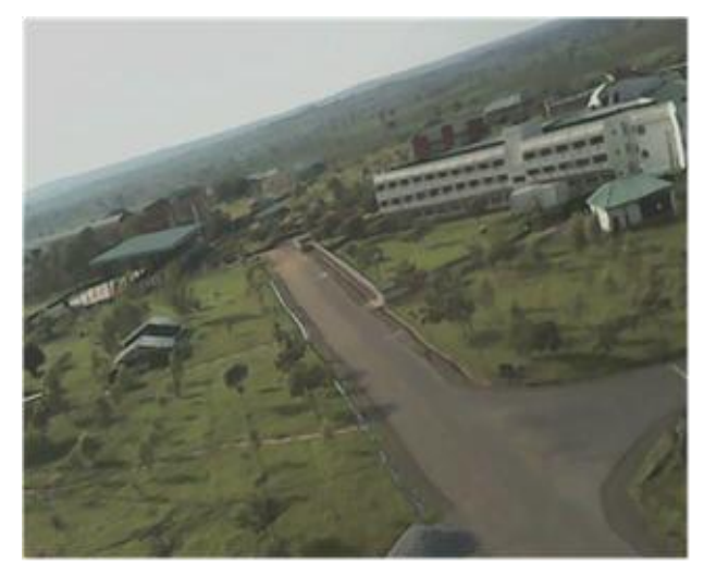
Plate 7a. FUT Minna, Senate Building Road