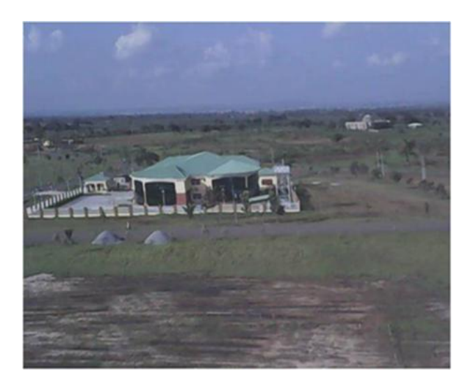
Plate 7c. FUT Minna, Academic Publishing Center

Plates 7 (a), (b), (c) and (d) show some of the aerial photographs taken by the quadcopter while aloft in campus.