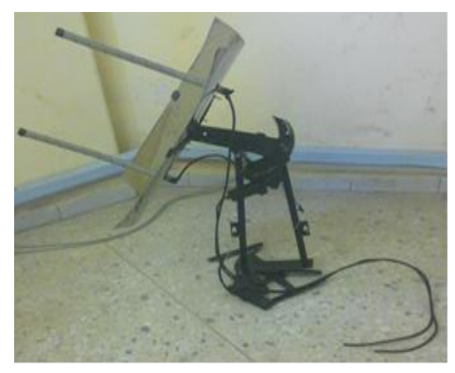
Plate 5. The helical antenna mounted on the Dual axis motorized stand