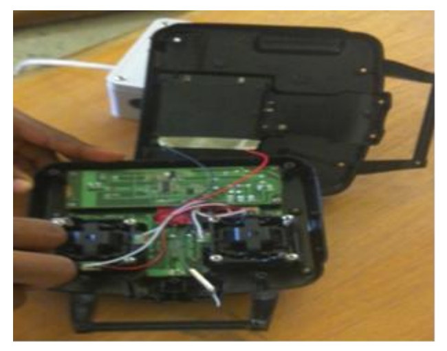
Plate 2. Pigtail antenna on the control board