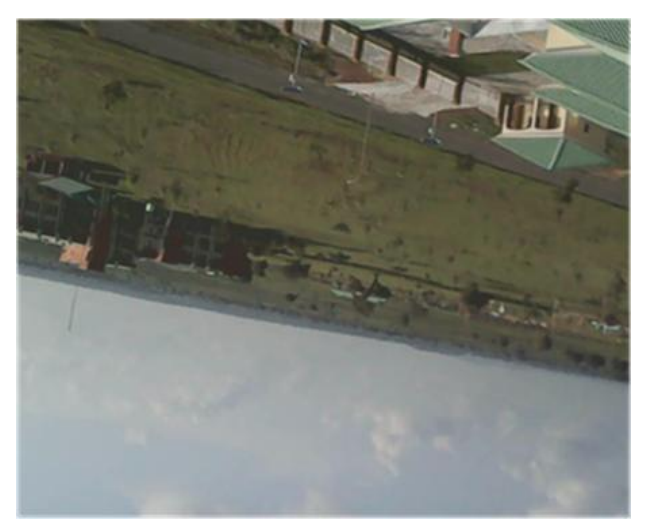
Figure 1. Plate 7d. FUT Minna, Back of Senate Building

The initial average communication range between the quadcopter and its control pad was measured after several field trails to be 108 meters. However, with the introduction of the Pigtail/Helical Antennas, the new average communication range was measured after several field trails to be 308 meters line of sight. It was observed that while a great distance was achieved, the battery capacity reduced from 5 minutes to 3 minutes due to the amount of power being consumed by the antennas.