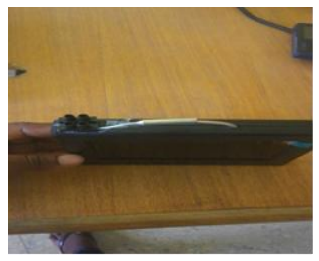
Plate 3. Pigtail antenna on LCD screen receiver.