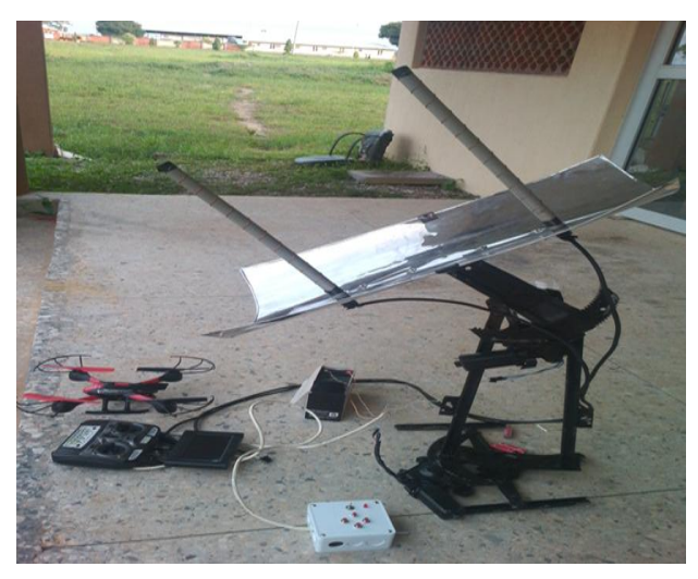
Plate 6. UAV extender system