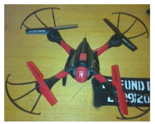
Plate 1. The assembled Quadcopter