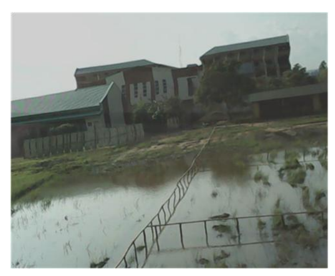
Plate 7b. FUT Minna, Research Farm