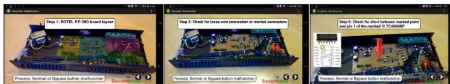
Fig. 2. Snapshots from a guided step-by-step procedure for detecting and repairing an electronic board fault.

Cognitive situational context mode. The basic self-service mode with stateless query processing flow can be enhanced by interaction with an cognitive assistant system which can comprehend the situational context. Specifically, the cognitive system behavior is dependent on the history of users' interaction with the system, as well as user's interaction with recognized objects. When the context is maintained, user