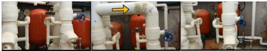
Fig. 1. Visualization of the scene-rooted AR annotations in technical environment, given as arrows and yellow dots with textual labels.

user's field-of-view and displays a prescribed augmented item (information icon, name, small document) near the identified object. These augmented items are anchored in 3D space to the identified object. The annotations points are positioned correctly relative to the observer point of view and tracked with his motion, as seen in Figure 1. In this mode the user requests information related to anchored annotation points. Examples include: retrieving a specification sheet of a pressure valve, displaying a menu of a restaurant, performing a repair with step-by-step guided instructions (see a visualization in Figure 2), streaming live telemetry of an IoT device, or providing analytics based on measured data. The retrieved information is displayed on either smart see-through glasses, or interlaced with the mobile camera feed, mimicking a see-through user experience. Note that the AR system set up in the self-service mode does not require network connectivity since AR models and augmented information are preloaded on the device.