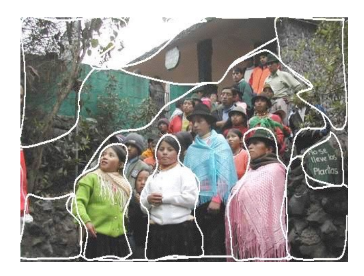
Fig. 2. "About 20 kids in traditional clothing and hats waiting on stairs. A house and a green wall with gate in the background. A sign saying that plants can't be picked up on the right."

in the images are closer to the formal qualitative representations of the relationships compared to the counterpart linguistic descriptions.