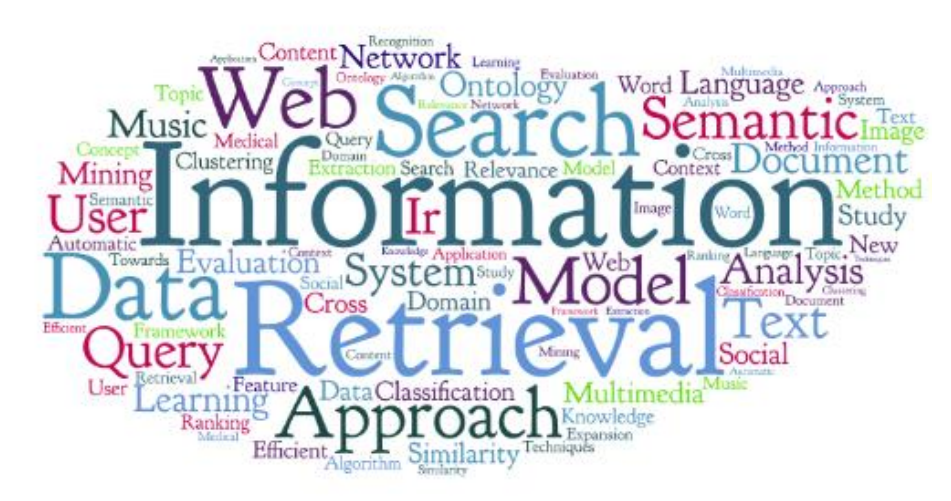
Fig. 3: The most frequently occurring title words