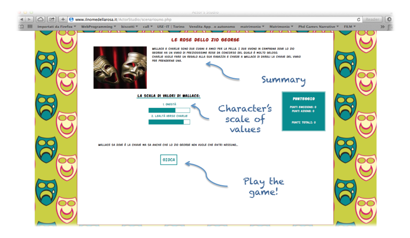
Fig. 3. A screenshot of the interface of the online testing system (in Italian).

Test procedure and material . The experiment was conducted online, via a text-based web interface. For each scenario, a short text introduced the character and her/his values, then a narrative situation was described that put a stake the character's values. The scale of values was presented to participant not in a numerical format but with a figurative scale, in order to make the values priorities apparent at first glance (see Fig. 3). The task of identifying the expected course of action and emotions for the character was introduced to the participants as a game: the participants were asked to pretend they were exercising identification in an acting class, in order to leverage their capability to take the point of view of the character and behave "as if" they were the in the character's shoes. For each scenario, a pair of alternative actions were submitted to the participants, who also had to select a set of appropriate accompanying emotions. Each narrative situation was encoded in formal terms as described in Section 2 and the resulting formalization was employed to generate the behavior of the main character.