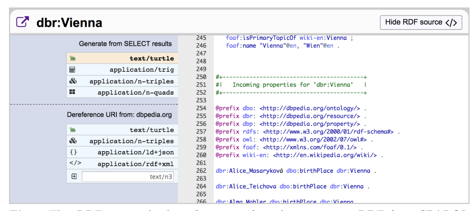
Fig. 4 The RDF source display of our interface that generates RDF from SPARQL SELECT results, and enables dereferencing with prescribed MIME types.

in Figure 4, serialized text is dynamically generated from already downloaded SPARQL SELECT results, ensuring that the final output is an accurate reflection of the triples contained by the encapsulated dataset. This also essentially bypasses the need to make additional requests for DESCRIBE queries which are not always supported by SPARQL endpoints. However, we also complement this feature by enabling the client to dereference a resource using some RDF serialization format. The client may select or manually enter a MIME type that will set the Accept header of the HTTP request to the resource URI.