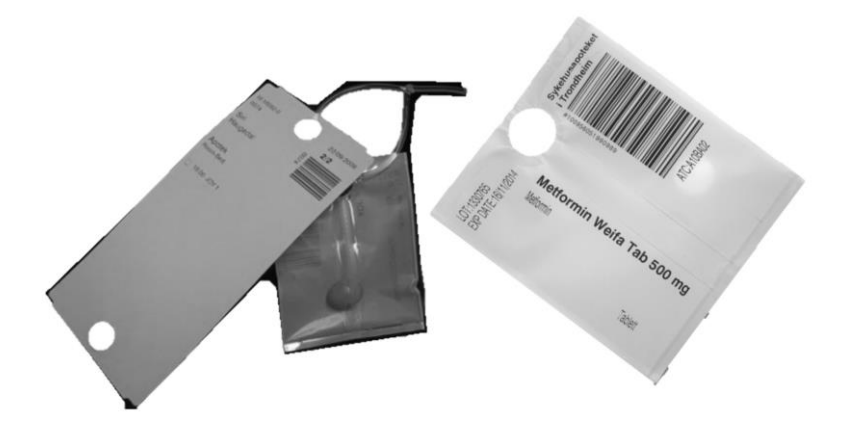
Fig. 2: Unit dose with patient tag (left) and barcode on bag (right), produced at the hospital pharmacy in Trondheim

The unit dose packaging system at the hospital pharmacy can repack tablets, capsules, suppositories, ampoules and vials. In addition to the automated dispensing and labelling of unit doses, pharmacy personnel manually barcode multi-dose packages (e.g. mixtures and ointments) and other medications that are not suitable for repackaging. This manual approach also assures traceability in the supply chain for these medications. The unit dose facility at the hospital pharmacy in Trondheim has a production flexibility that allows it to dispense medications for a day's consumption for the individual patient at a 750-bed hospital. The actual medications are then collected on a plastic ring with a patient tag (Figure 2). This functionality is currently not in production, awaiting introduction of electronic ordination through the electronic health record (EHR) procurement-project (Helseplattformen). Meanwhile, the unit doses (without patient labelling) are supplied to local storage at the hospital wards and allocated into patient-specific trays in medication trolleys.