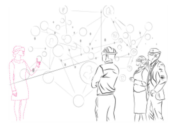
Fig. 7: The HoloMuse.virtual.laboratory enables a co-present exploration of research data or simulations in physically dispersed spaces as well as co-creative knowledge generation.

up a whole range of possibilities for interlinking digital humanities research directly with museums, their collections, exhibitions as well as informal cultural learning. Latest research becomes interactively available to life-long learners, involving the visitors in co-creative knowledge generation processes around the data on multiple devices (see also [13]). This offers benefits for both museums and researchers, binding back the research to the museum as trusted information source.