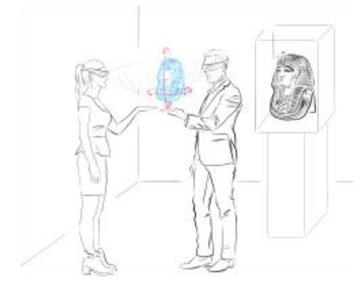
Fig. 5: A guide discusses a virtual object with a visitor during a guided Holomuse.tour.

Humans learn from humans. Therefore, HoloMuse will be integrated with human mediation and guided tours. During a guided tour through the physical museum space a guide may pass around virtual objects to individuals or a group. This enables visitor interaction e.g. with closer explanations of fragile museum artefacts which otherwise could not be touched in a museum environment (see Fig. 5; a similar feature was also presented by [12]). Additional information or media content can be augmented and discussed directly in relation to the object.