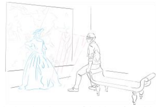
Fig. 2: HoloMuse.immersive.spaces – A fictional character from a painting steps out of the artwork via Augmented Reality technology, acting as a guide giving insights about the work.

Thus, this mode allows to transform every possible existing location into a learning space , augmenting the physical location with new and old knowledge, stories, possible histories, presences and futures. HoloMuse allows to immerse into the depicted fictive world of an artwork. For example, a character of a painting could step out into the gallery space and act as copresent gallery guide introducing the (hi)story of the artwork and context of the depicted scene. The fictive character becomes an ,,authentic" authority to give interactive and contextual information and to represent the artistic idea (see Fig. 2).