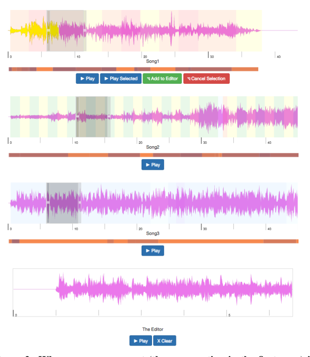
Figure 2. When a query segment (the gray section in the first song) is selected, a menu with a segment selection option appear at the bottom of the song such that the user can add the segment into the medley editor (bottom row). The system then calculates and suggests the user potential next segments (the gray boxes in the second and the third song.)

in the visualization and computation of the cost function described below.