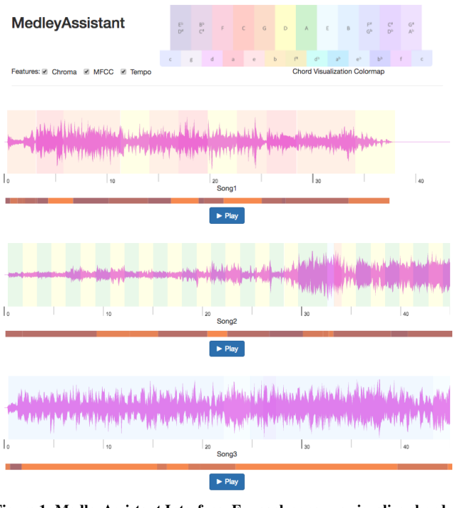
Figure 1. MedleyAssistant Interface. For each song, we visualize chords (as colored blocks on the waveform) and tempo (as a color density bar below the waveform).

so we have a total of 24 chords. The color scheme we used in visualizing each chord is inspired by Alexander Scriabin's "Clavier à lumières" ("keyboard with lights") [10], a keyboard instrument with colors assigned to different keys. For example, we use intense red for C and orange for G. We utilize this color scheme because similar color produces a desirable chord progression, such as the proximity in RGB color value of the chord C and G. The color mapping of the chords are shown in a chord visualization colormap in Figure 1.