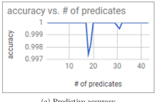
Figure 3a shows that in experiment 1 the mean accuracy of the learned definitions stayed near 100%, and Figure 3b shows learning times remained consistently below 1s (with some outliers) throughout the series, confirming the first hypothesis.