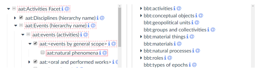
Fig. 1. The AAT term natural phenomena and the BBT hierarchy

A Use Case Example. Suppose we are building a knowledge aggregator based on the generic Backbone Thesaurus <sup>7</sup> ( BBT ) and we need to integrate data from a provider that uses the Art & Architecture Thesaurus <sup>8</sup> ( AAT ). Using the BBT as the target terminology and the AAT as the source for the alignment process, the concepts of the AAT get subordinated to BBT which's structure is persisted. Both terminologies contain a facet named activities : in BBT, the facet classifies intentional actions, while in the AAT it encompasses areas of endeavor, physical and mental actions, etc. But the AAT activities facet includes in the taxonomy the concept of natural phenomena (Fig. 1). We argue that the latter violates the subsumption in BBT according to the BBT definition of activities . Hence, in order to set up an exact-match correspondence between the activities terms, it is important to exclude the inconsistent subhierarchies of the AAT term.