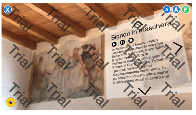
Fig. 2. AR screen of UniBSArt4All app.

The app also allows tailoring content and interaction according to the possible disabilities of the user. In particular, in the user profile, one may declare a hearing or visual impairment, thus allowing the app to adapt its interaction possibilities. For instance, in the case of visual impairment, the app provides voice-over features and organizes the pages in a way suitable to screen readers and selections made by visually impaired users (Fig. 1(b)). In this case, beacons are used to detect the closest artwork and tell the user all related contents. If more than one artwork is detected, a simplified pop-up, suitable to visually impaired users, is shown (and told) to allow artwork selection. In case the user declares to have a hearing impairment, suitable videos are proposed, including subtitles or descriptions through sign language.