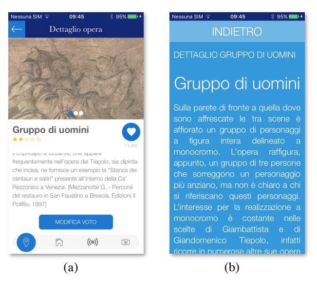
Fig 1. Child' view of artwork description (a) vs 'blind' view suitable to screen readers (b).

Accessibility of contents are managed through the user profile. In particular, on first access to the app, the visitor may declare to be a child, a tourist or a scholar, and the app will select automatically the contents that are most suitable to that type of user. For instance, children may enjoy a description suitable to their reading skills and have the possibility to vote the artworks they like (Fig. 1(a)).