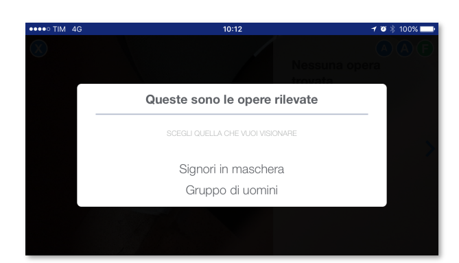
Fig. 3. Automatic detection of artworks through BLE technology.

Museum curators may use a web-based EUD tool to manage the structure and contents of the app (Fig. 4). In this way, it allows an easy adaptation of the project to any type of museum. This tool allows curators to create the museum floors and their related rooms, as well as all data associated to the artwork objects available in the museum, with the specific contents related to the different user profiles. Moreover, they may easily assign beacons and photos to artwork IDs for easy retrieval at run time. Through the EUD tool, the curators can also manage user accesses and monitor visit trends.