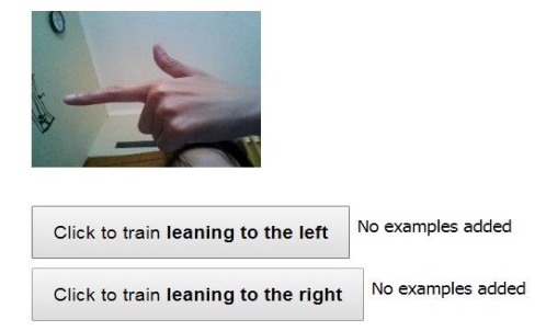
Fig. 4. Capturing image for training process

When the 'Train block' runs, a tab will be launched for capturing image from camera to train (see Fig.4).