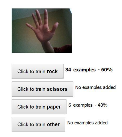
Fig.5. Training process for rock, paper and scissor games

After the training process, the students tried to play the game which uses camera imagines as an input. Afterwards the students compare their result with their friend's then they observe if there are different results.