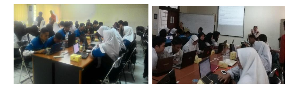
Fig 6. Learning Atmosphere

Even the class sound crowded by students chattering, but no students are downstream while studying (See Fig 6).