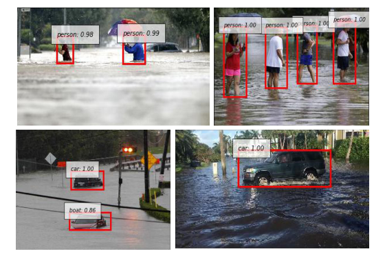
Figure 1: Image examples showing the contrast in visual properties of 'person' and 'car' in non-passable (left column) vs. passable (right column) classes.

MediaEval'18, 29-31 October 2018, Sophia Antipolis, France