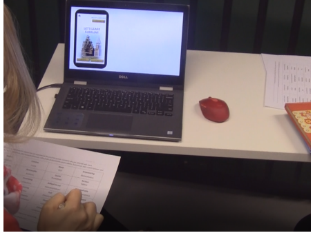
Fig. 2. A user studied alphabets in the learning mode (left) and after the use of the prototype she selected 4 out of 24 adjectives, which depicted her experiences (right)