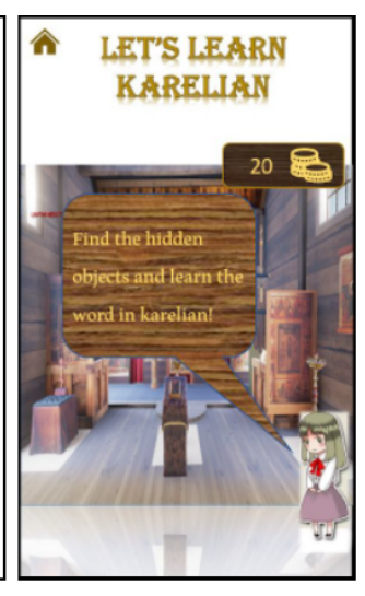
Fig. 1. Landing Page, Learning Mode, and Playing Mode of Non-Functional Prototype